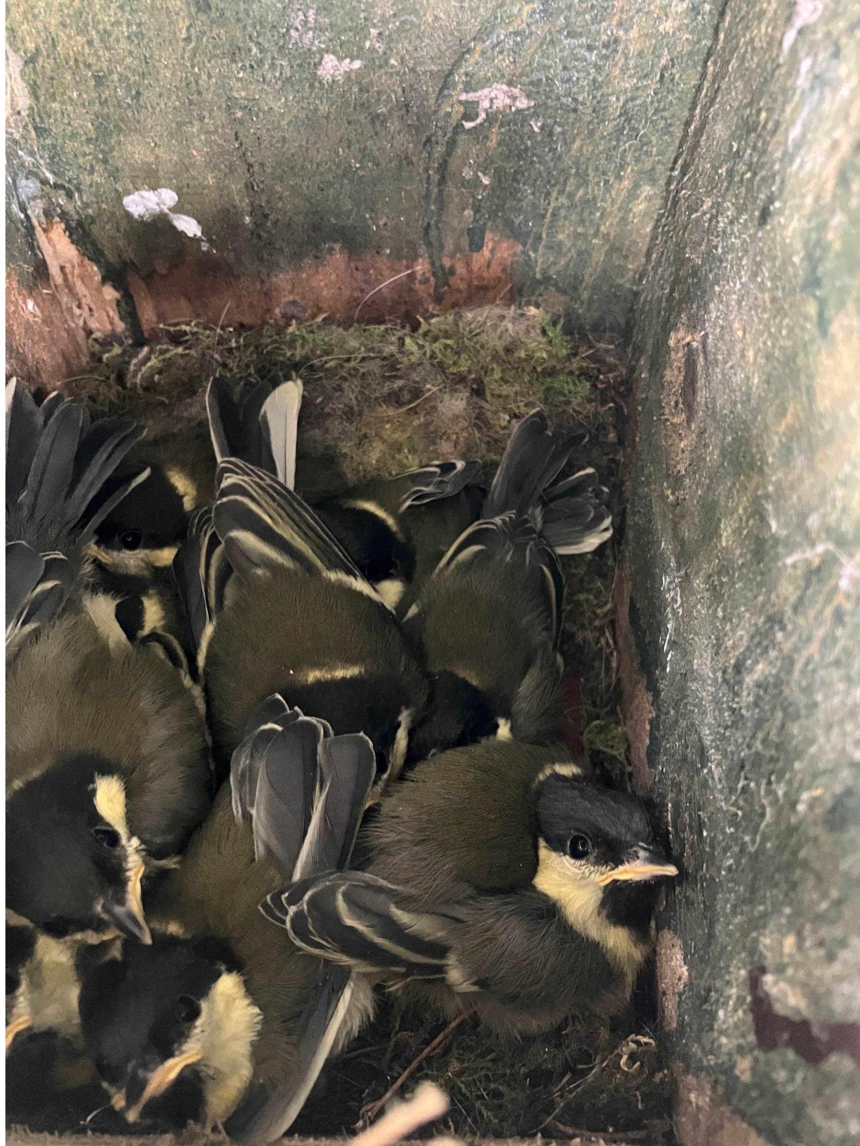
Great tit fledglings