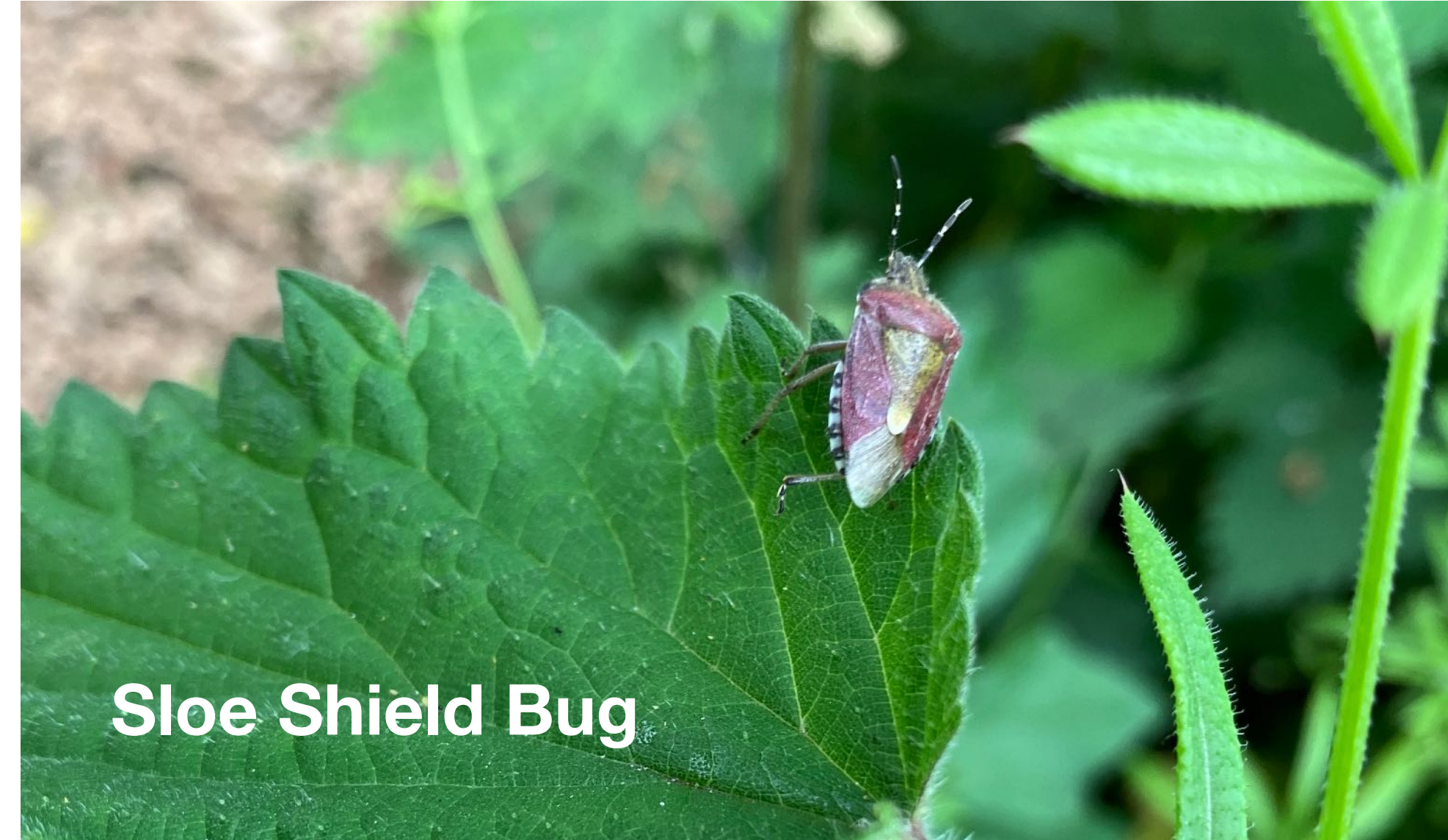
Sloe Shield Bug