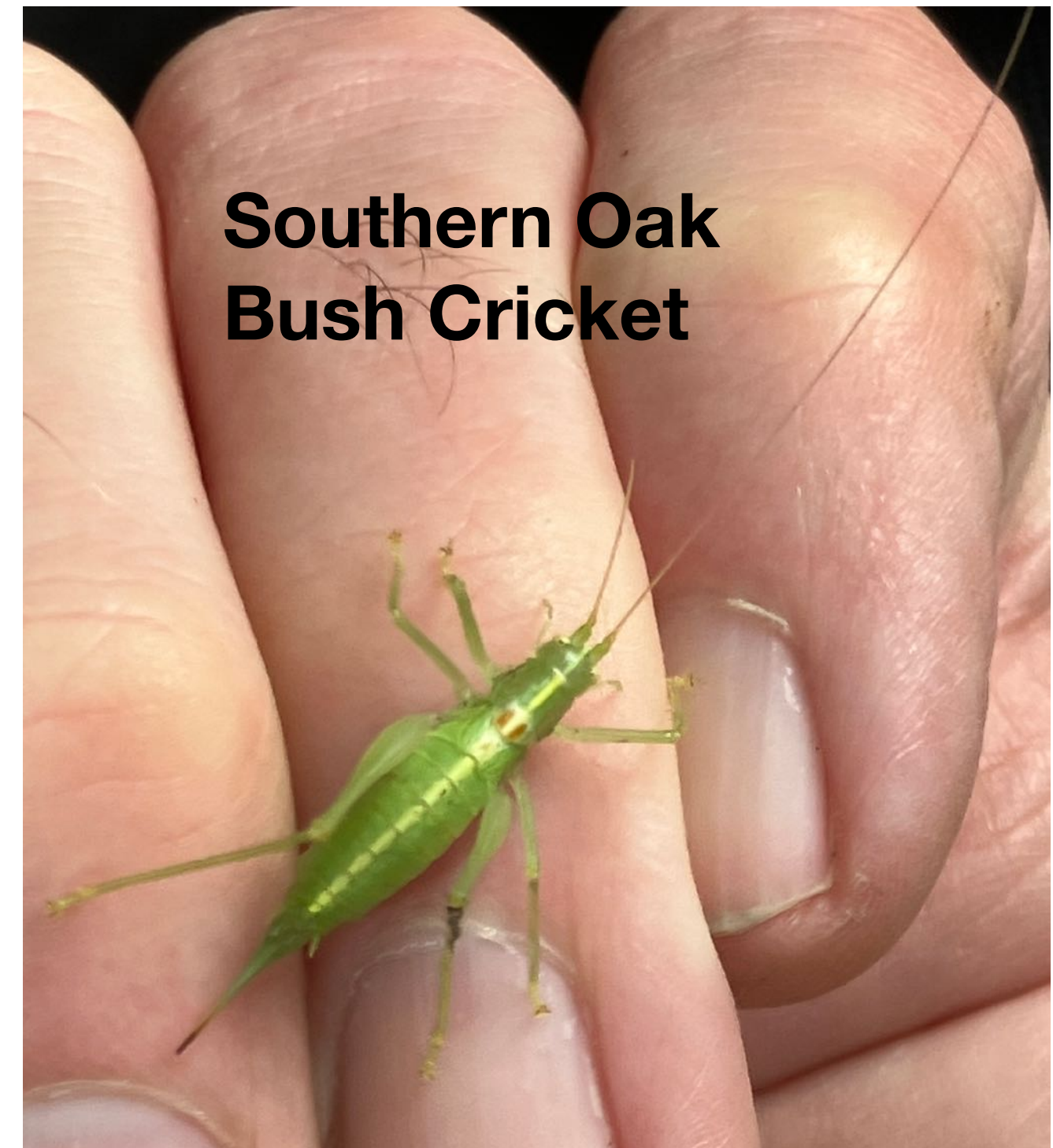
Southern Oak Bush Cricket