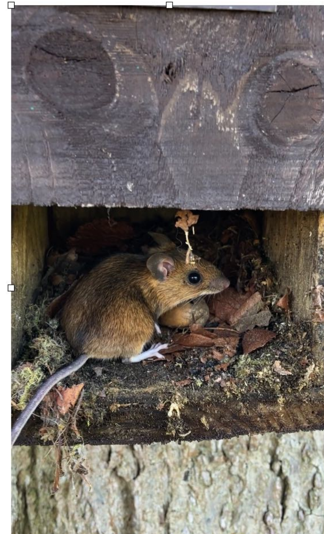
Nest box with sheltering woodmice