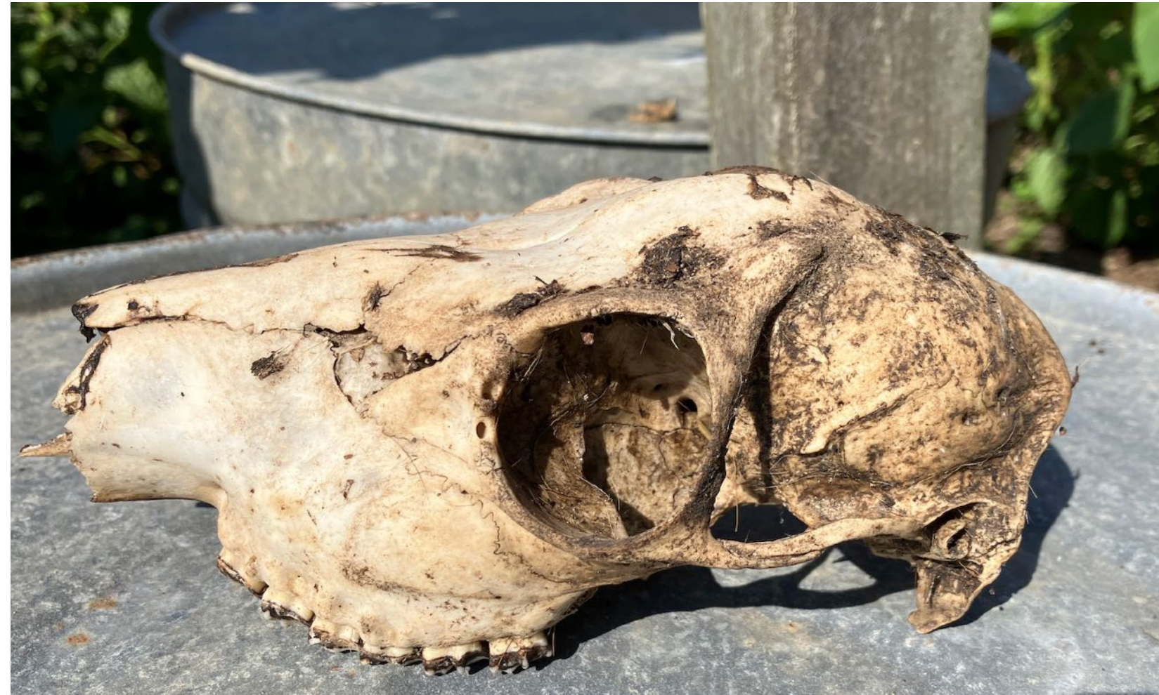
Roe deer skull found in allotments. Probably introduced by a fox.