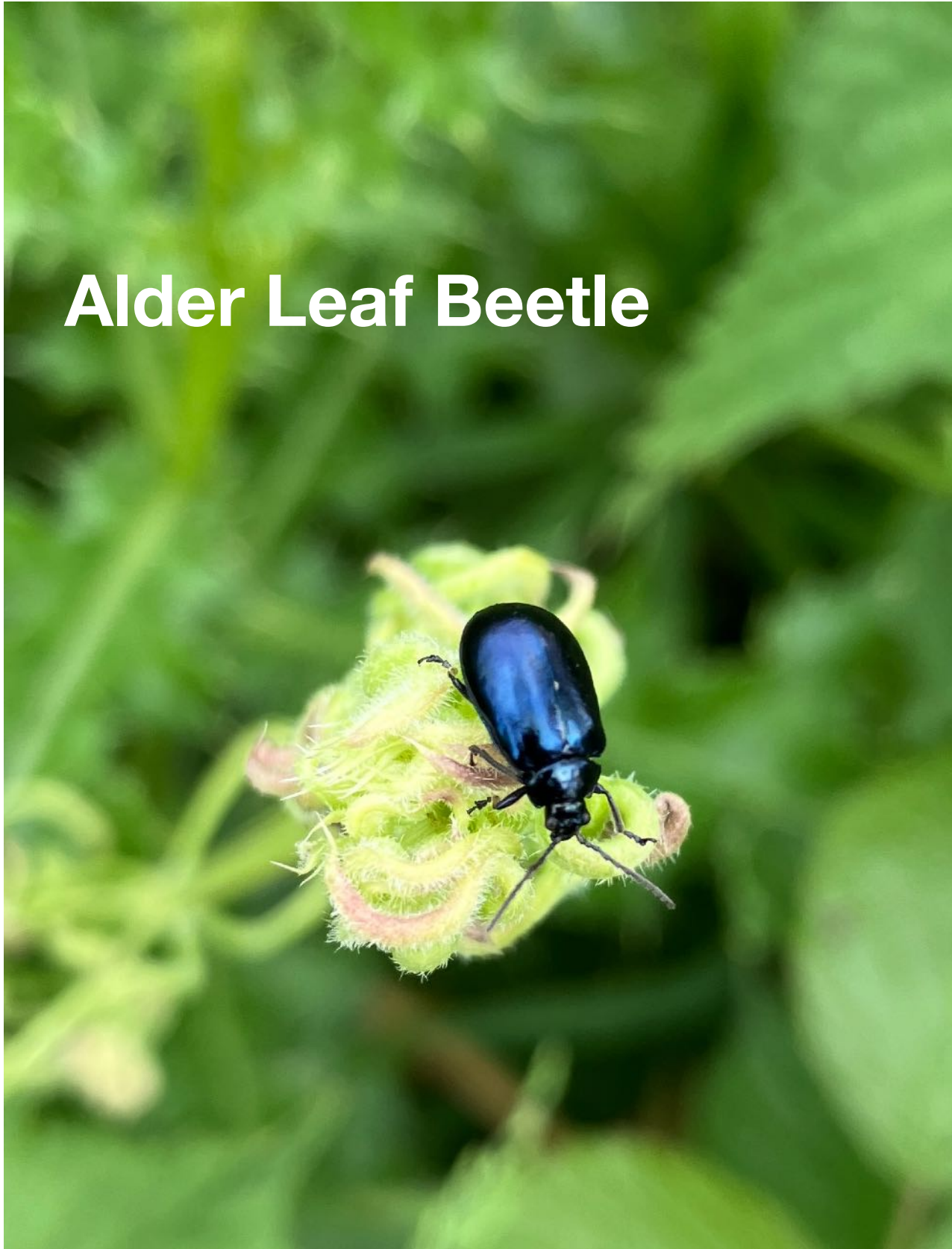
Alder Leaf Beetle