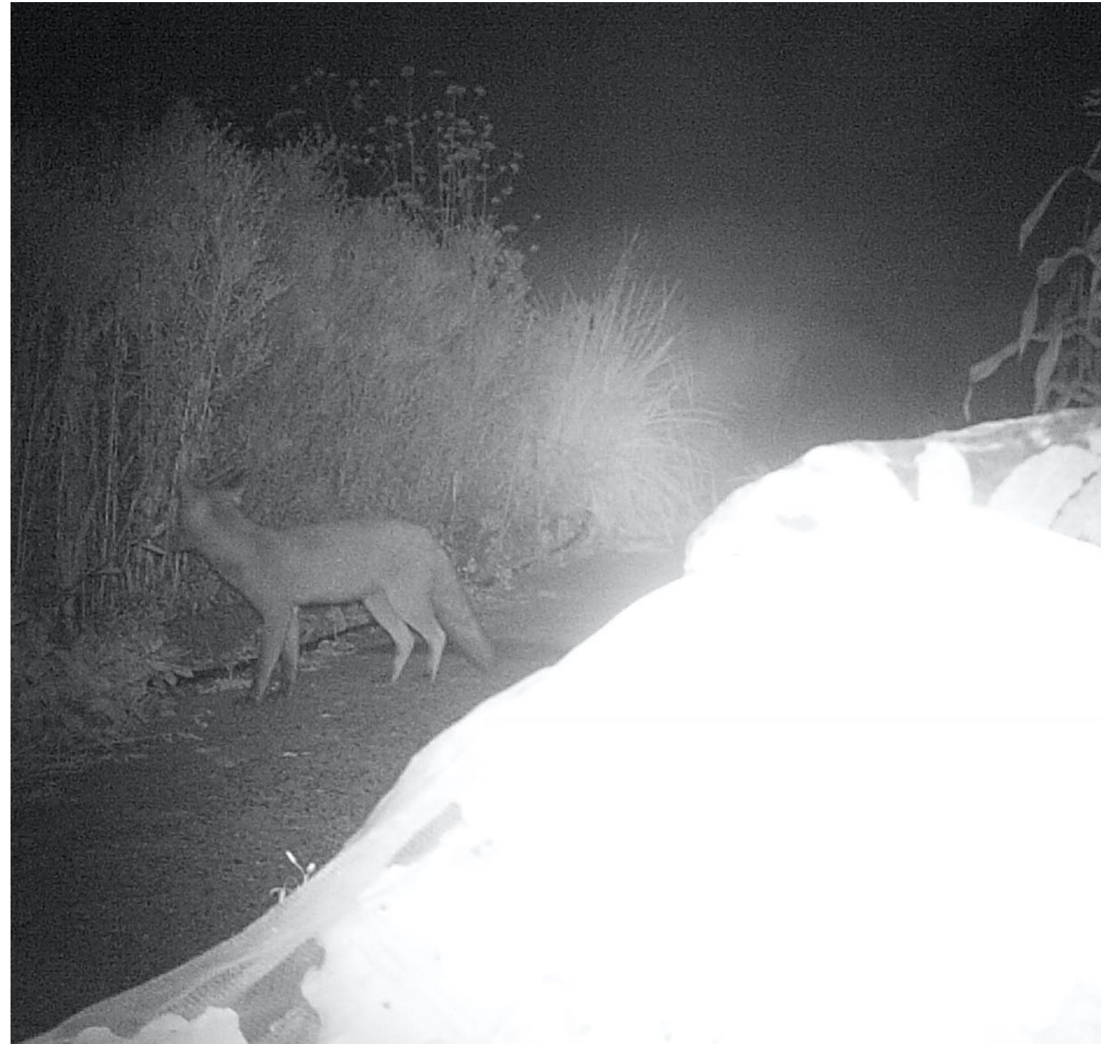
Unlikely suspects. Fox and carrion crow.